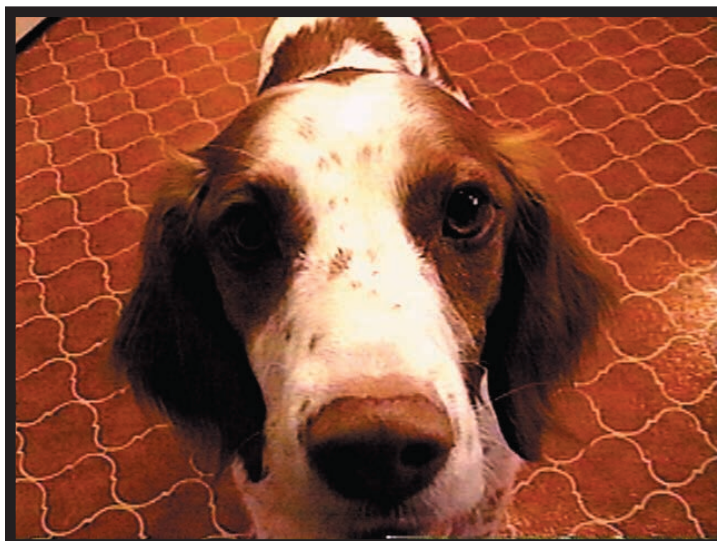
“Whatcha Doin’, Mom?” Jasper the Brittany Spaniel, Honorable Mention in SPDR’s Photo Contest

Many breeds have large litters. Do you enjoy staying up all night? Are you willing to risk that promotion at work because you had to stay home on midwife duty? Are you prepared to watch puppies die as a result of complications? Are you prepared to watch your dog die as a result of complications? Are your children prepared to witness every aspect of this? Are you prepared for a doggy cesarean or a litter of sick puppies and the accompanying $1000.00 vet bill?